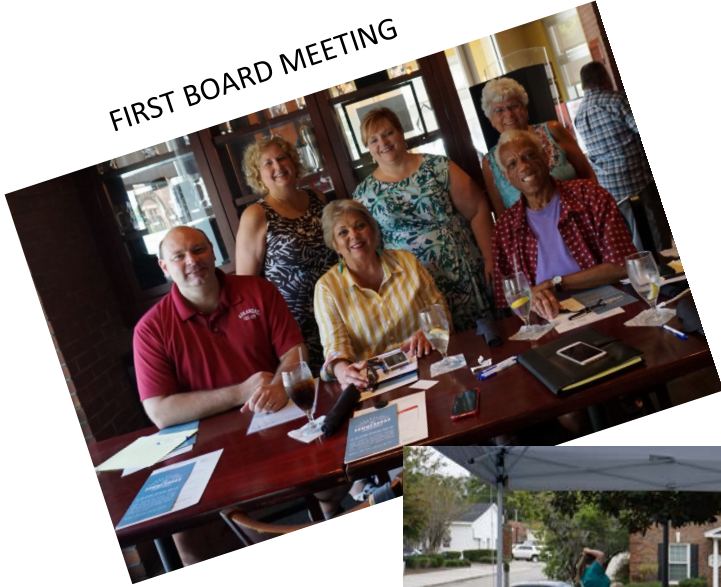
FIRST BOARD MEETING