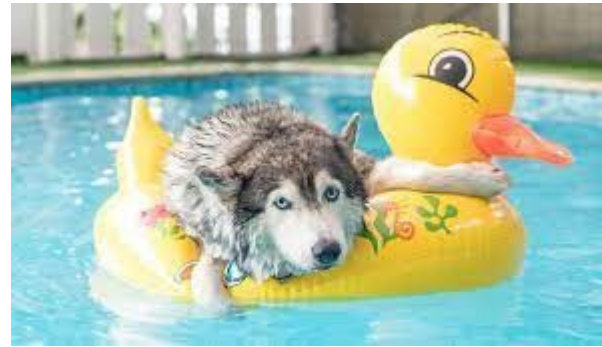
“Dog Days of Summer”

I grew up hearing this term in the middle of summer, and in my youthful reasoning, noticed that the family pooch seemed to pant harder and seek more shade, so I concluded that it was referring to the heat being unbearable, even for a dog. While it is a reference to the hottest days of summer, July to August 11 th , it has nothing to do with our favorite pet.